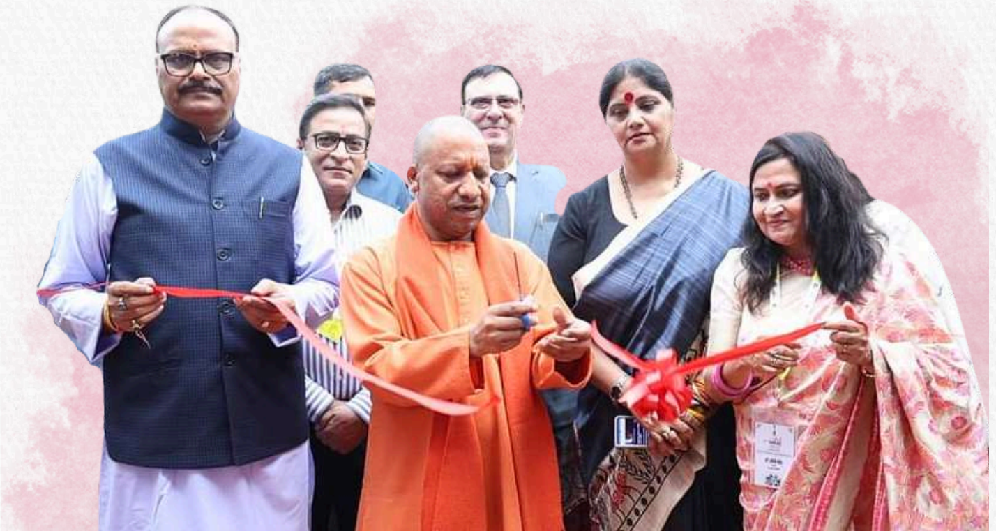
Uttar Pradesh Chief Minister Yogi Adityanath inaugurating 'Akanksha Haat 2024' at Indra Gandhi Pratishthan in Lucknow