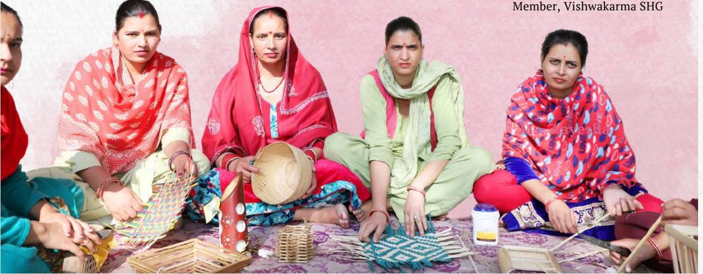
Crafting Traditions: Artisans of the Vishwakarma Self Help Group Showcasing their Handmade Creations