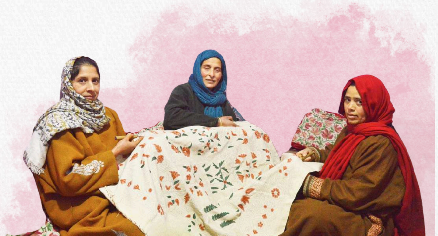
Crafting Prosperity: The Remarkable Journey of Heaven SHG's Embroidery Unit