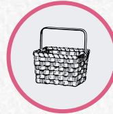
Handicrafts (Decorative Items, Baskets)

The Vishwakarma Self Help Group specializes in producing several notable bamboo items: