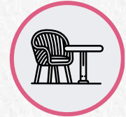
Furniture (Chairs, Tables, Shelves)