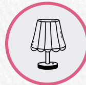
Home Decor (Lampshades, Wall Hangings)