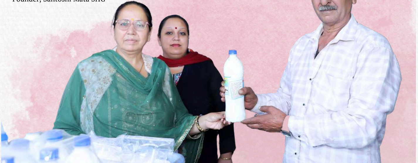
Phenyl, Perseverance, and Progress: The Remarkable Journey of Udhampur's Women Entrepreneurs