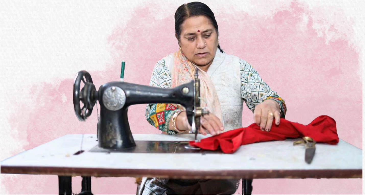
Handmade Success: Transforming Traditional Skills into Modern Enterprise