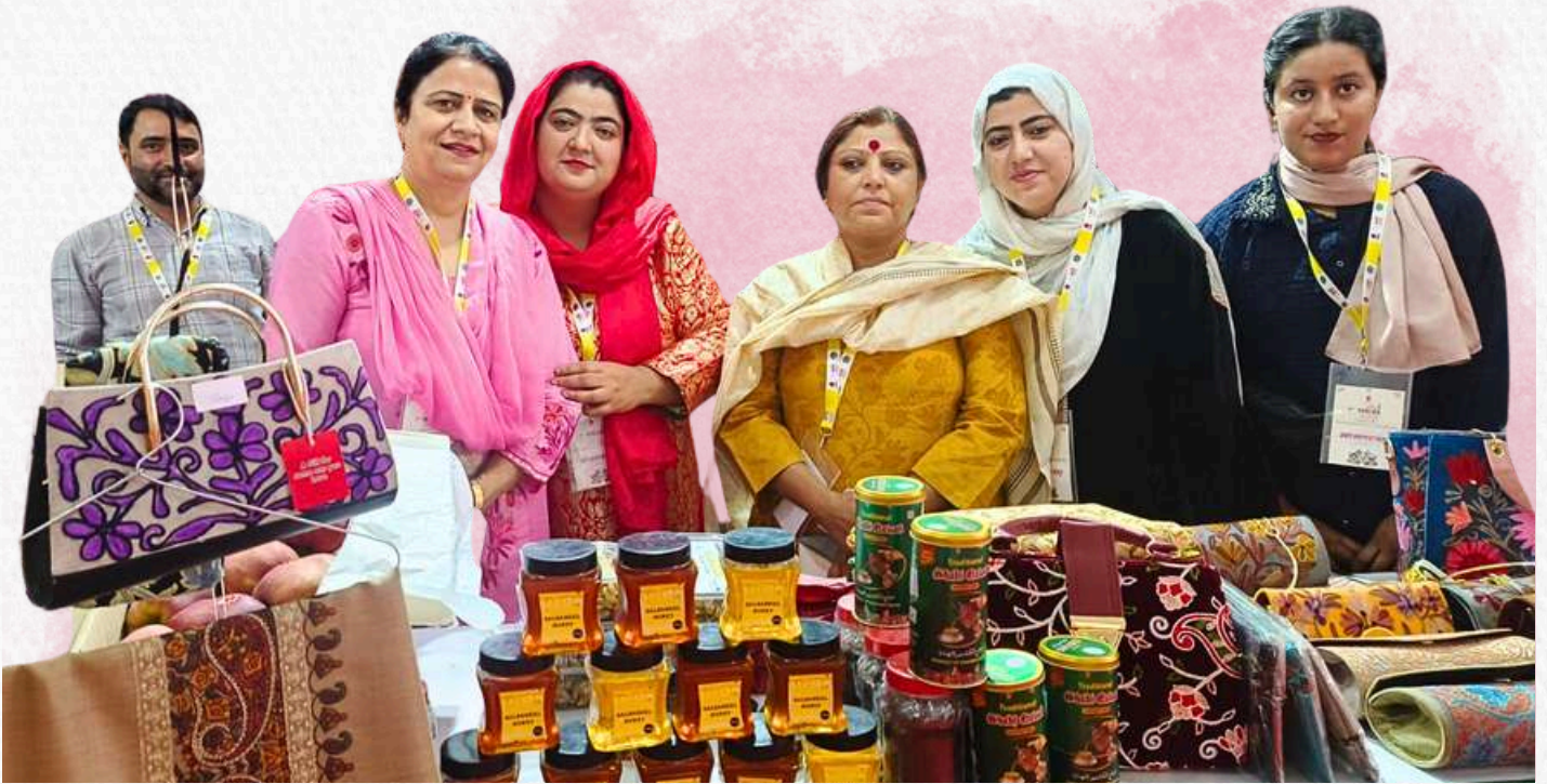
Self Help Groups from Jammu and Kashmir along with their products at 'Akanksha Haat 2024' Exhibition