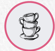
Utility Items (Plates, Cups, Cutlery)